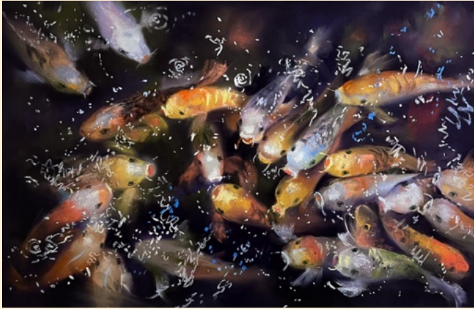
"Rush" was juried into the 2023 Virginia Artists Juried Exhibition, Charles Taylor Visual Arts Center, Hampton, VA