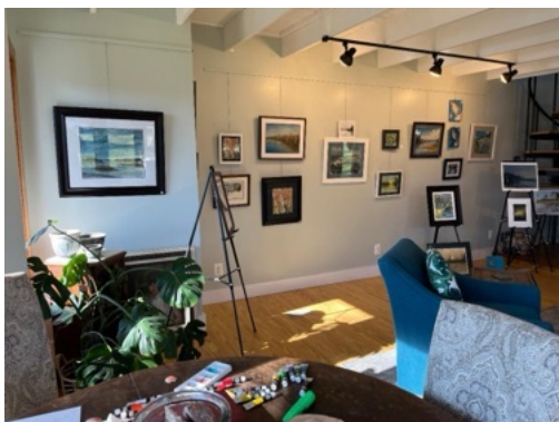
Walt Hayes recently renovated his studio and has created a great working space. It includes a commercial style hanging/display system that makes it super easy to move and hang paintings without punching holes in the wall. The inexpensive tripods provide movable display space for framed work.