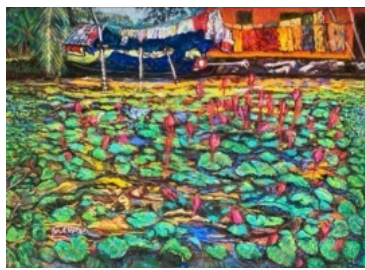
"Laundry Day on Vembanad Lake" by Thomas Mammen (12" x 18")

"Laundry Day on Vembanad Lake" is a view of Vembanad Lake in the southern Indian state of Kerala. This idyllic lake is covered with water lilies so dense they jostle each other upwards, becoming invasive.