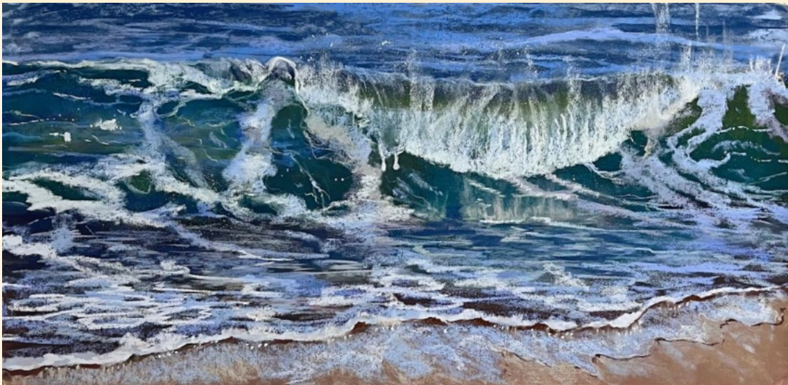
"High Noon" was juried into Out of the Blue National Juried Exhibition, Gallery Underground, Arlington, VA