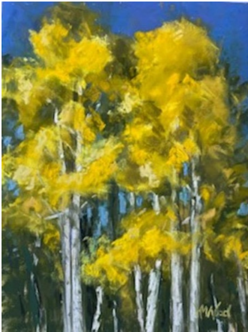
"Aspen Glow" by Helen Wood (12" x 9")