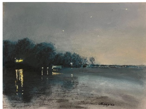
"Edge of Dark." by Walt Hayes

He is also making plans to open a gallery here sometime next year. Walt recently completed a nocturnal painting titled "Edge of Dark." "It's a late evening view from our pier looking towards the Potomac River."