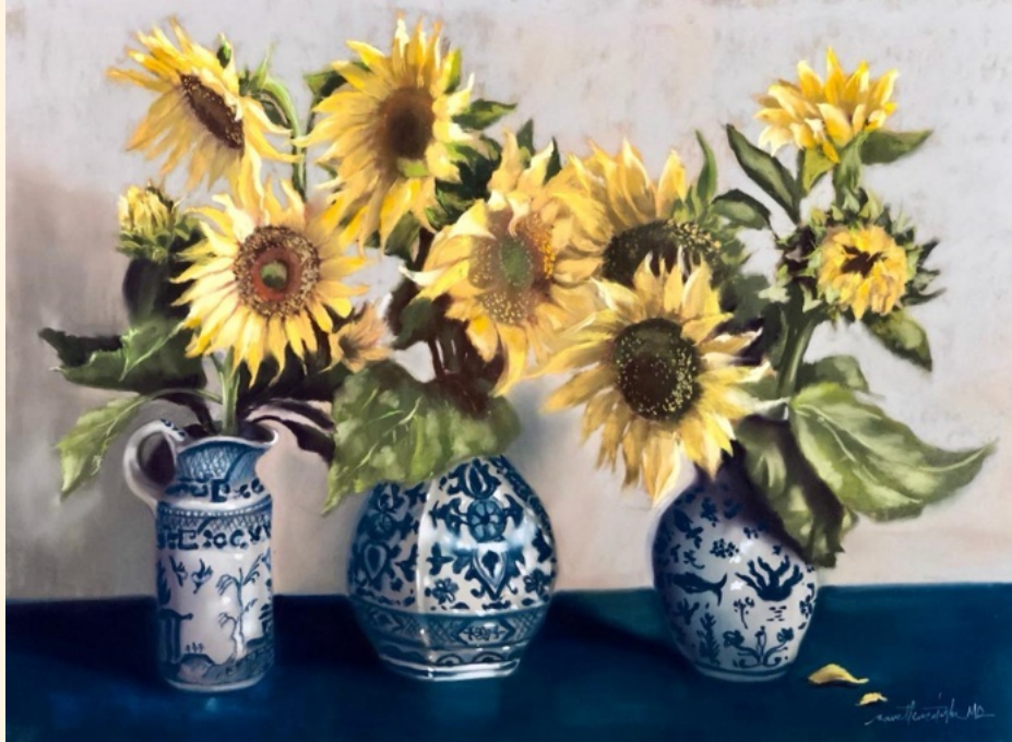
"Tres Marias" won Honorable Mention in Art & Color Magazine , Summer issue