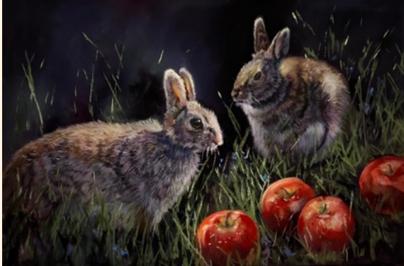
"Harvest Moon" was juried into the 7th Annual Pure Color International Exhibition, Pastel Society of North Carolina (online show)