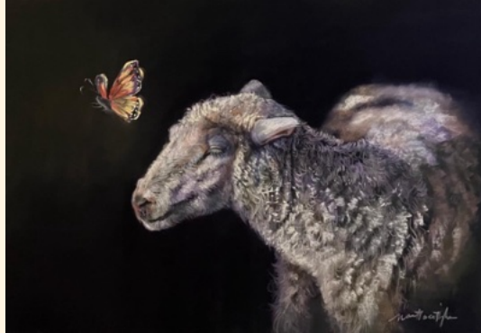
"I Shall Not Want" was juried into the Philadelphia Watercolor Society's 123rd International Works on Paper (online show)

Her move to Virginia in 2021 inspired her to make new paintings. She tirelessly creates wherever she may be, whatever season, and whenever she can. She is a Signature Member of Maryland Pastel Society and Baltimore Watercolor Society, and Associate Member of other art societies.